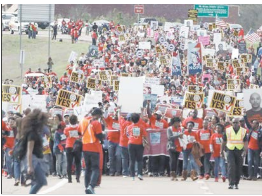
Thousands take the 2 mile walk to the Canton Nissan plant.