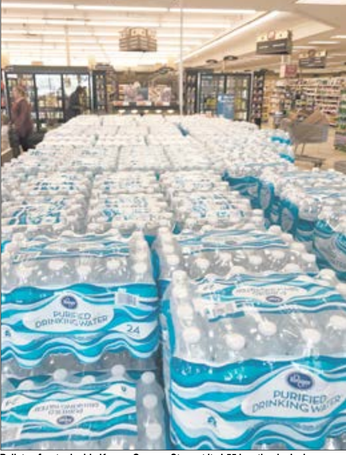
Pallets of water inside Kroger Grocery Store at its I-55 location in Jackson