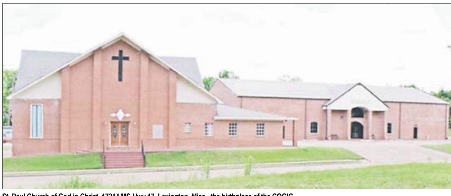
St. Paul Church of God in Christ, 17214 MS-Hwy 17, Lexington, Miss., the birthplace of the COGIC.

COGIC origin misunderstood by some now further clarified