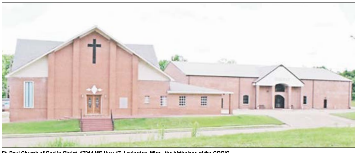
St. Paul Church of God in Christ, 17214 MS-Hwy 17, Lexington, Miss., the birthplace of the COGIC.

COGIC origin misunderstood by some now further clarified