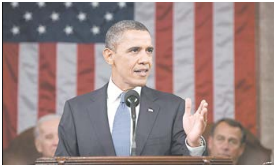
President Barack Obama delivered his farewell address as the leader of the free world on Tuesday, January 10 in Chicago, Ill. This photo was taken during the 2011 State of the Union Address.

"It's easy to lose sight of that in the blizzard of our minute-to-minute Washington news cycles. But America is a