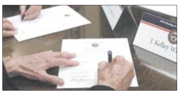
Members of the Mississippi Electoral College sign certificates of vote in the process of formally casting their electoral votes in Jackson, Miss. Dec. 19, 2016.