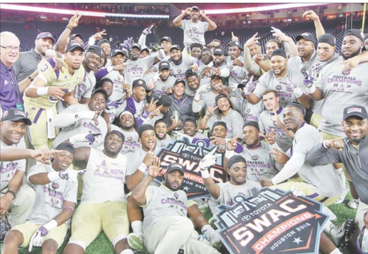
Alcorn Braves revel in their championship win last weekend over Grambling.

Braves headed to inaugural Celebration Bowl