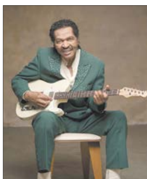
Bobby Rush, 82, may win over new fans with the release of his new album.